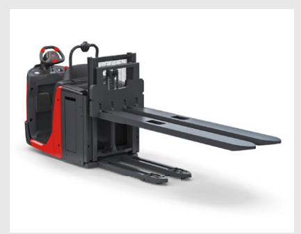
Intuituve Linde Steering Wheel