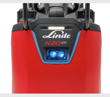
Linde BlueSpot™ and front LED light